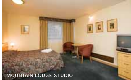
MOUNTAIN LODGE STUDIO