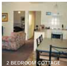
2 BEDROOM COTTAGE

Self-contained cottages and motel style accommodation centrally located in the heart of Silver City.