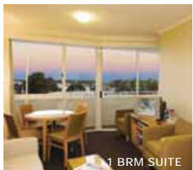
1 BRM SUITE

Beach 50m Shop 100m Map 2 Page 64 Ref. 1