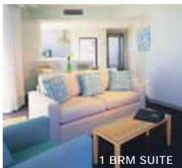
1 BRM SUITE