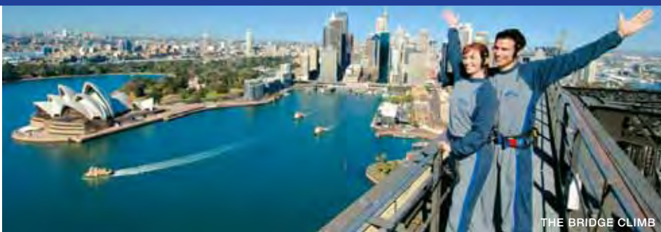
THE BRIDGE CLIMB

There are now two unique ways to experience the city of Sydney and the iconic Sydney Harbour Bridge with BridgeClimb Sydney. Climbers can choose between 'The Bridge Climb' and BridgeClimb's newest experience, 'The Discovery Climb'.