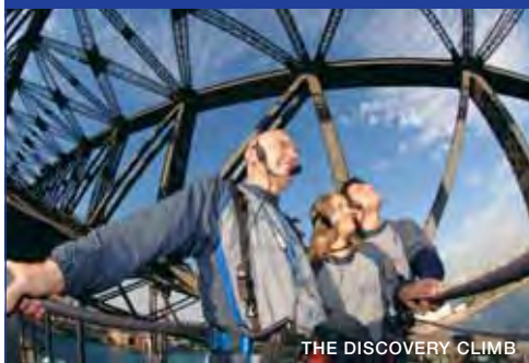
THE DISCOVERY CLIMB